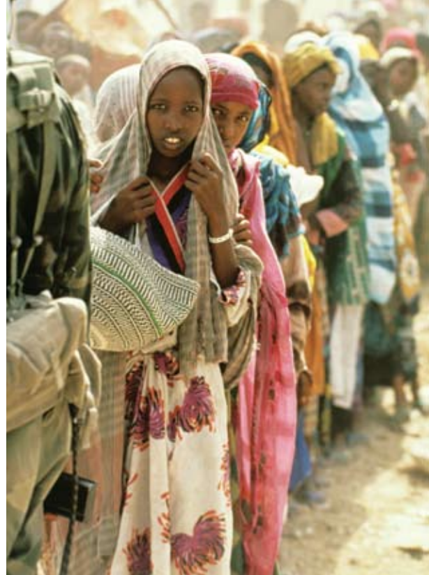
Somali women wait in line for food in Mogadishu, Somalia. The inability of the government to provide food to its people contributes, in part, to the instability persistent throughout Somalia.

According to the 2010 JOE, food shortages often result from policy decisions (such as poor distribution), population growth and dietary trends. However, “The main pressures on sufficient food supplies will remain in countries with persistently