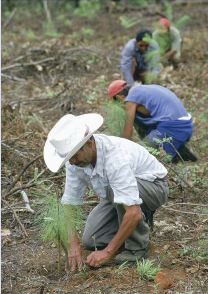
Individuals plant trees in Mexico, which has the 12th largest forest area in the world but also one of the highest deforestation rates in the world.