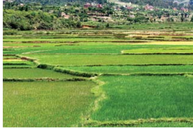
Rice fields in Madagascar. In 2009, a deal to dedicate land for direct export of Malagasy crops to South Korea contributed to civil unrest in the country that contributed to the overthrow of the government.

At the same time, according to the World Bank, 1.6 billion people rely directly on forests for their livelihoods. 103 (Forestry, for example, provides as many as 60 million jobs in developing countries.) One-third of the world's forests are mainly used for