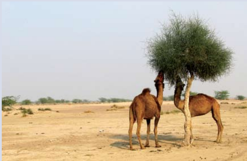
Overstocking and overgrazing in Pakistan contribute to exposed soils which can lead to erosion from wind and water and affect livelihoods.

Water: Only 31 percent of the population has access to safe drinking